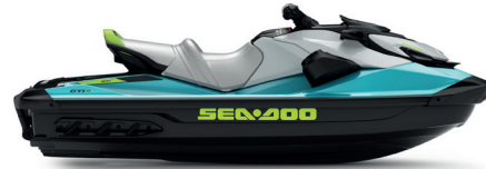
● Teal Blue and Manta Green