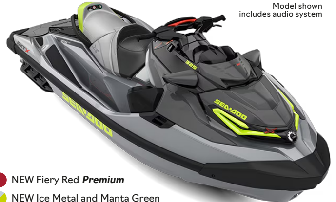
Model shown includes audio system